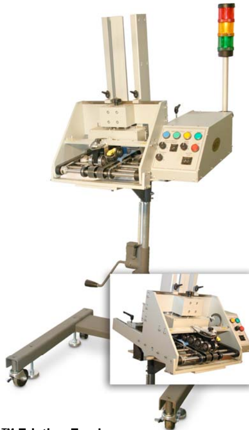
Impulse™ Friction Feeder shown with optional floor stand and stack light

DEPENDABLE AND CONSISTENT PERFORMANCE FOR GREATER PRODUCTIVITY