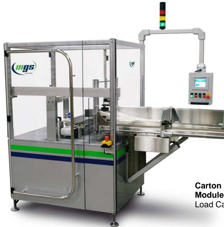
Carton Opening/Forming Module for the TLC™ Top Load Cartoning System