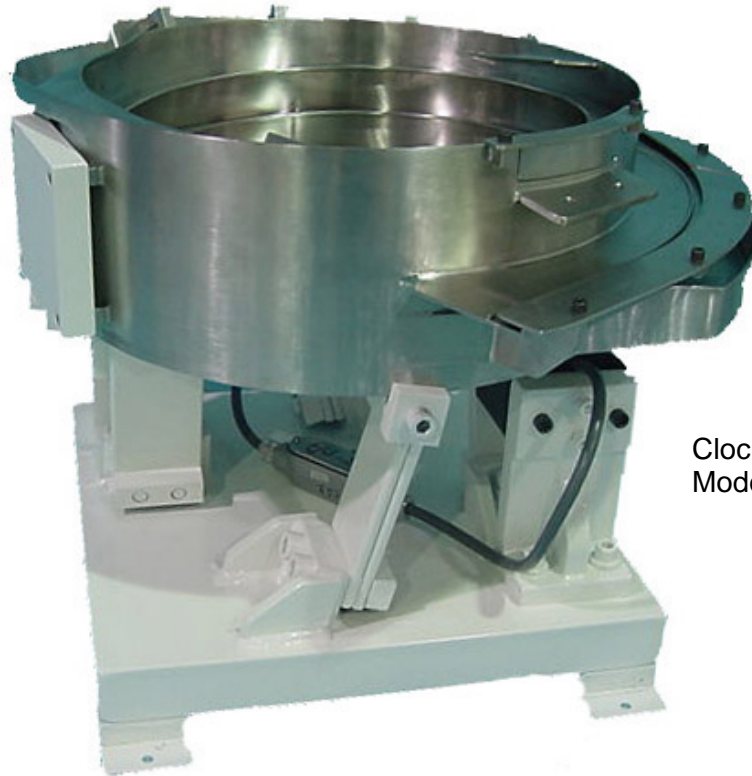
Clockwise Model 15" ID